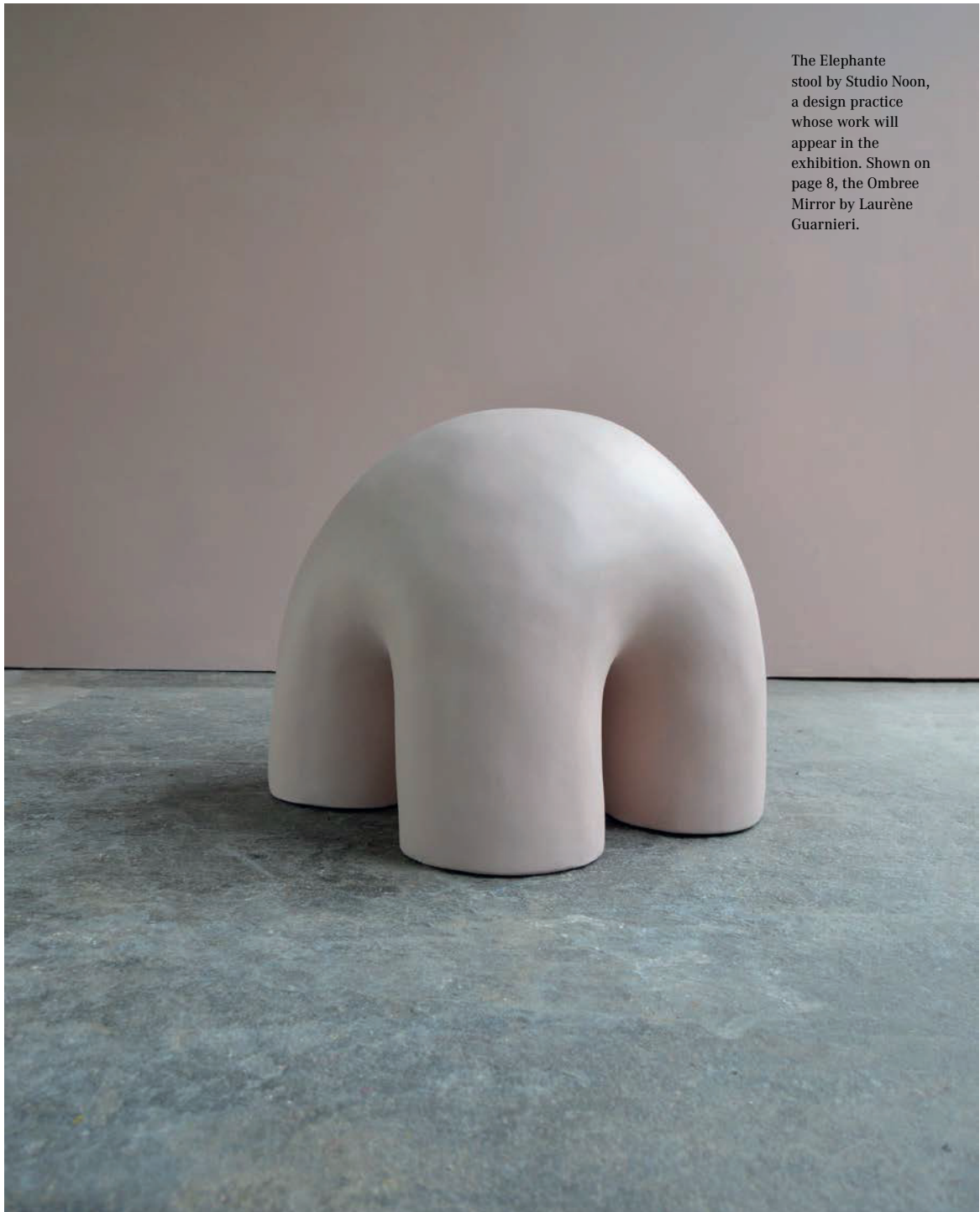
The Elephante stool by Studio Noon, a design practice whose work will appear in the exhibition. Shown on page 8, the Ombree Mirror by Laurène Guarnieri.