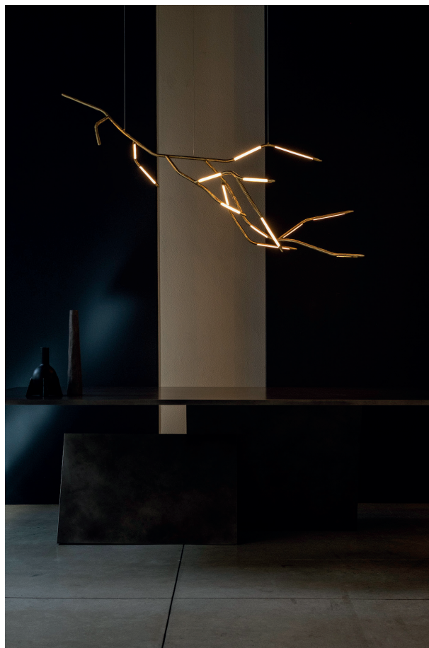
Dafne for Galerie Philia.

Concrete or marble? Both, depending on the application.