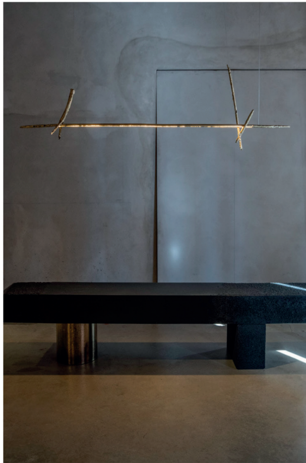
Prometeo for Galerie Philia. Photography by Ruud Vedel

What you absolutely must have in your studio: We can't work without a musical background! We have an old iPod with thousands of songs that goes on shuffle every day.