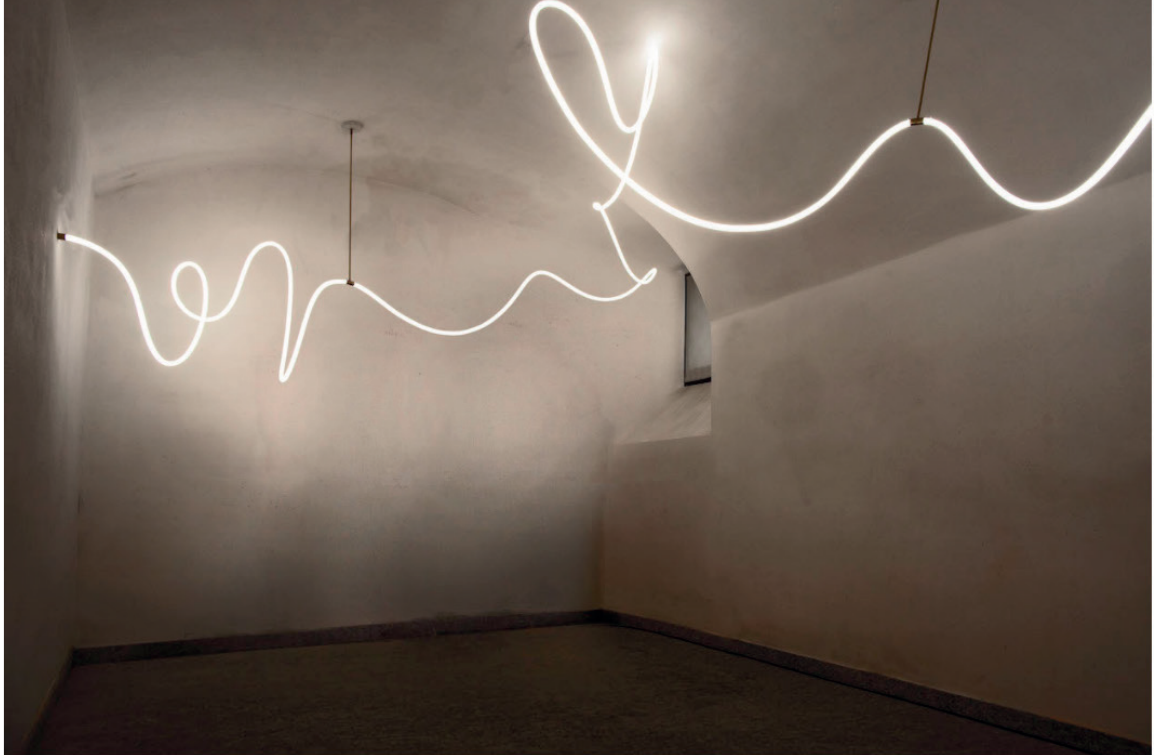
Fabric Flexible Light installation at Varallo Art Festival.

A new or forthcoming project we should know about: We have many projects in the drawer, among these another exhibition with Galerie Philia in Paris in October.