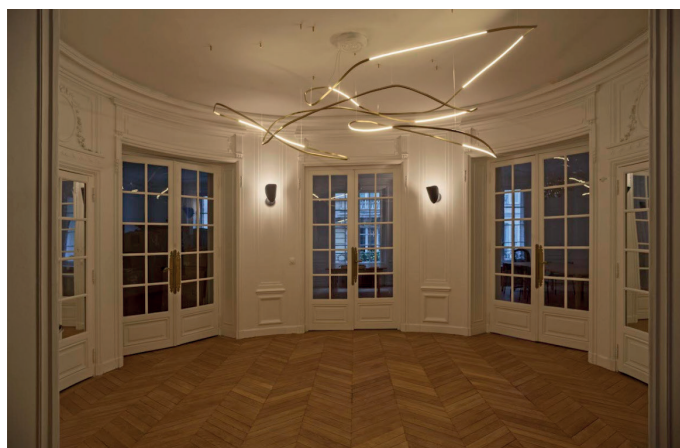
Ophelia for a private client.

Describe what you make: We are a multidisciplinary studio that works on the boundaries between design, art and craftsmanship. All of the works are handmade by us in our studio workshop in Milano. We work mainly with light, in all of its forms and shapes, relying on techniques passed on by the classic artisan heritage mixed with experimentation and contemporary materials.