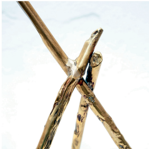
Prometeo detail.