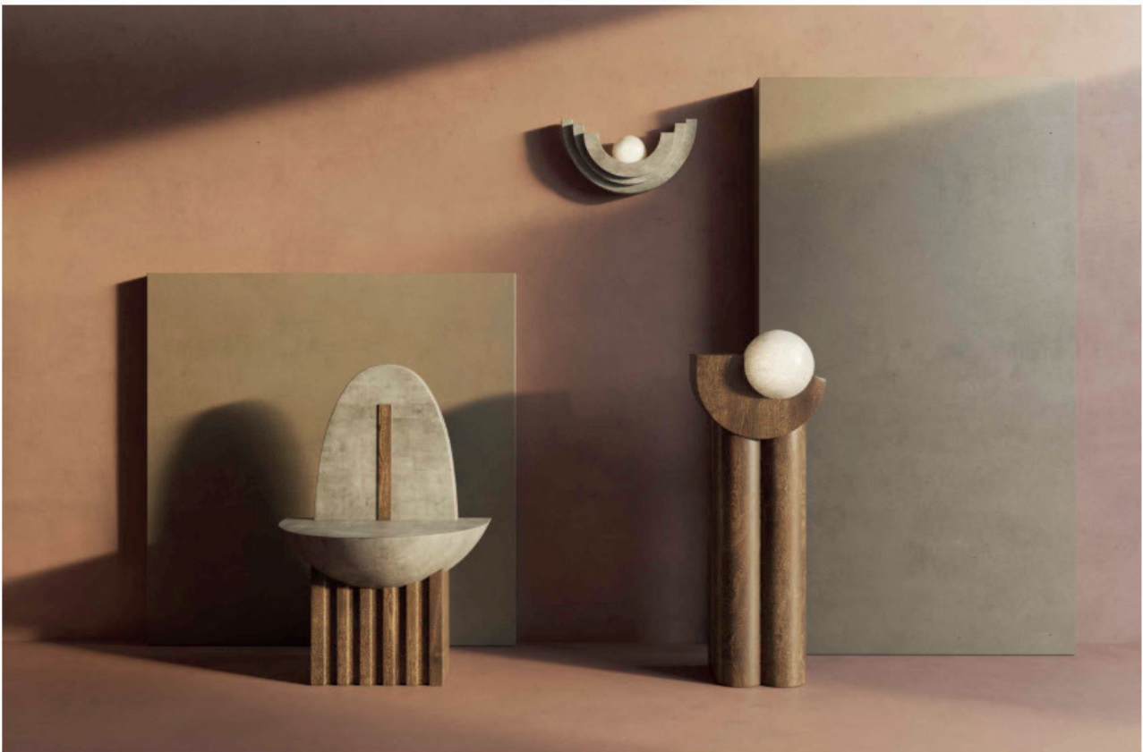
Terra, a sculptural trio including chair, floor and wall lighting, by Llewellyn Chupin

From upcoming disruptors to a new showcase of bespoke creations - the highlights of the Brussels' fair dedicated to 21st-century design