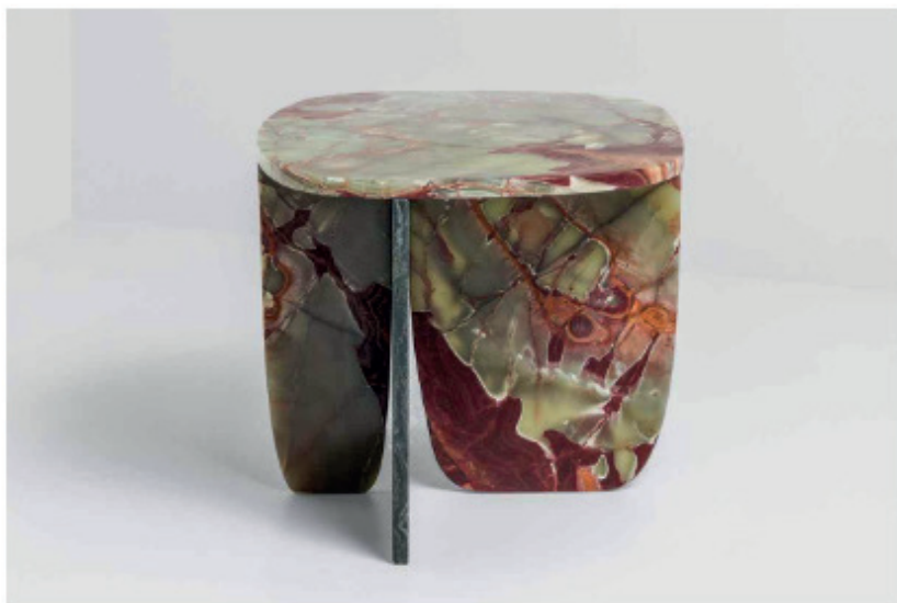
Trilithon, an onyx side table by Eindhoven-based studio OS & OOS