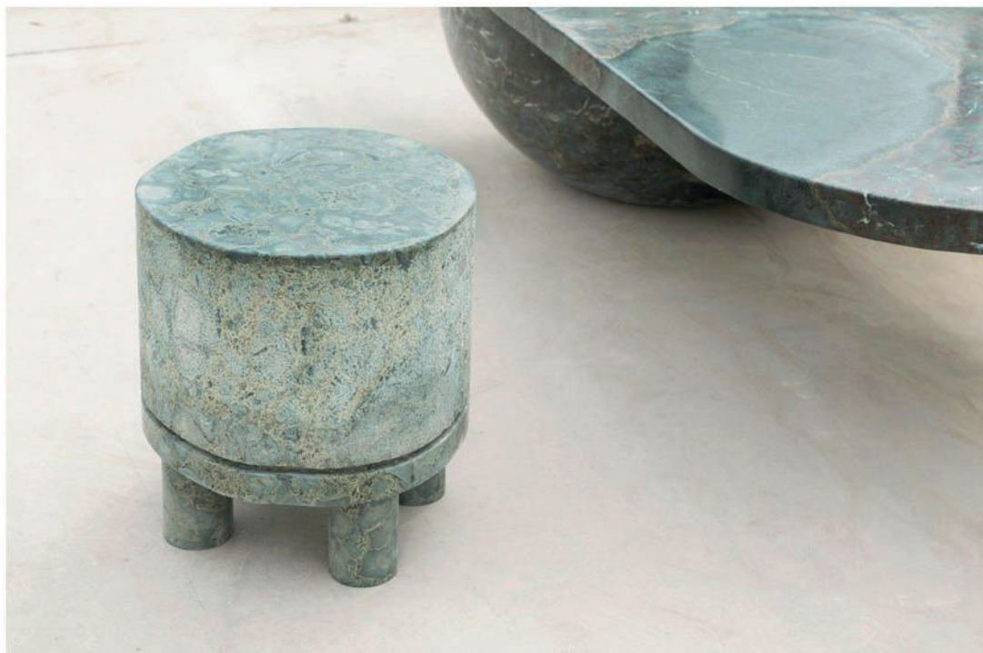
Rooms' furniture is featured in the exhibition

The exhibition showcases over 70 works by 40 international designers.