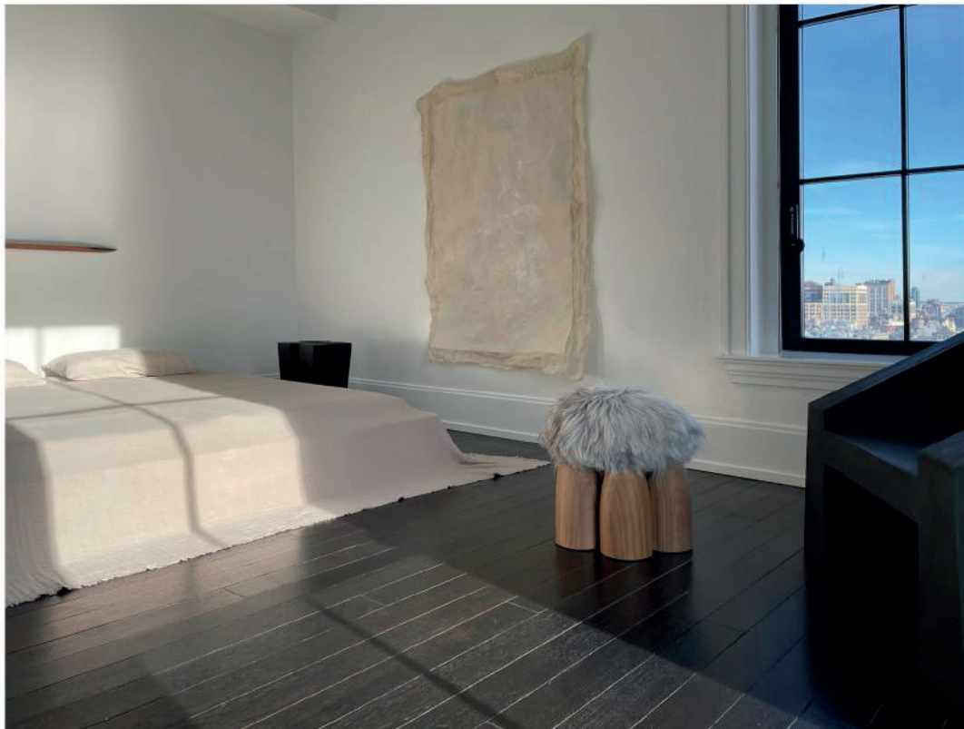
The exhibition space is designed to appear as both a gallery and a liveable apartment

The Walker Tower is what Franceschini considers the ideal contrasting backdrop to the minimalist exhibition, with its "hybrid of brick volumes and metal ornamentation."