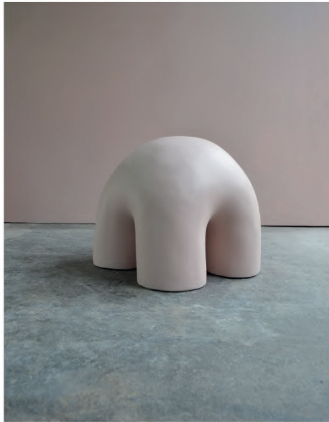
Studio Noon's Elephante stool