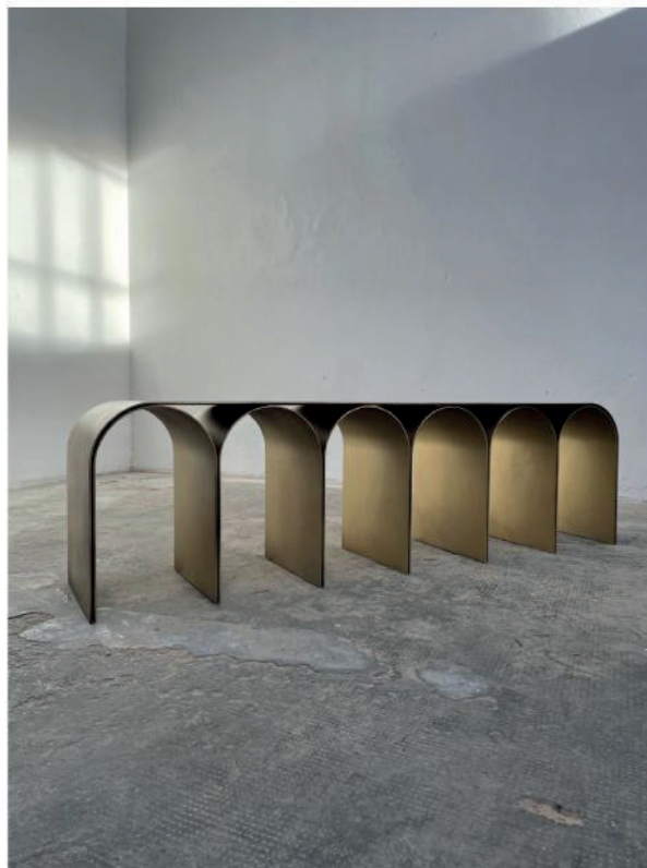
Furniture by Franceschini himself is exhibited, such as Gold Arch Console

Set against white walls, the majority of the pieces share a colour palette of black, white and brass.