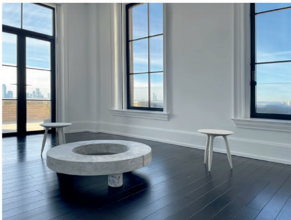
The exhibition's curation considers objects in relation to each other

"Materiality and detail entice the viewer to look more closely," he said of the works exhibited.