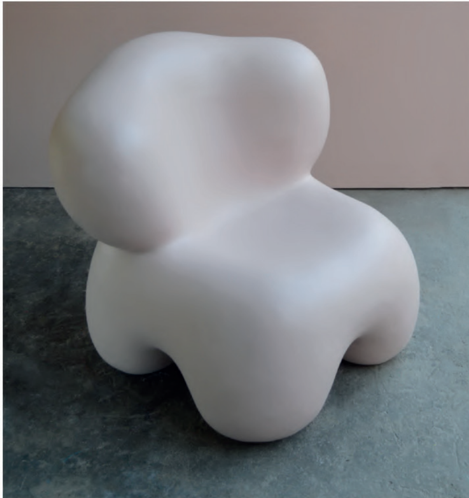
This chubby pink chair is one of two plump pieces offered by Studio Noon

"The common thread between the works can be expressed in a few key words: neutral colours, minimal but not reductive, and incredible craftsmanship," Franceschini told Dezeen.