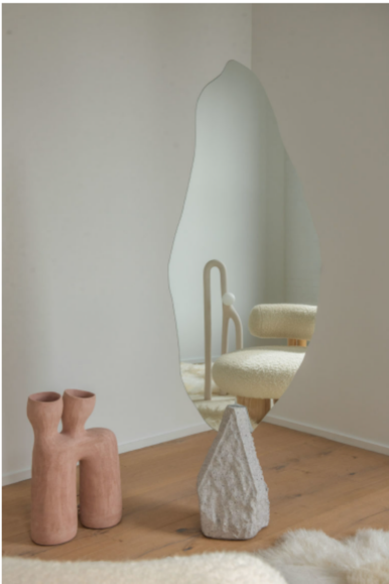
Elisa Uberti's Opera Pink Table Lamp plays well off of Andree Monnier's Narciso Mirror. (Jonathan Puente)

Set up in the sprawling modernist apartment and its Canal Street adjacent private roof top are 80 works. Presented in staged living rooms, dining rooms, bedrooms, bathrooms, and alcoves, these furnishings, luminaires, and accessories demonstrate Galerie Philia's ability to stage luxury properties. The visual relationships forged represent multiple permeations, sensibilities, and lifestyles. The underlying thread of muted tones, organicism, and sculptural articulations interplay well with hardline geometric planes. Texture abounds throughout the exhaustive selection.