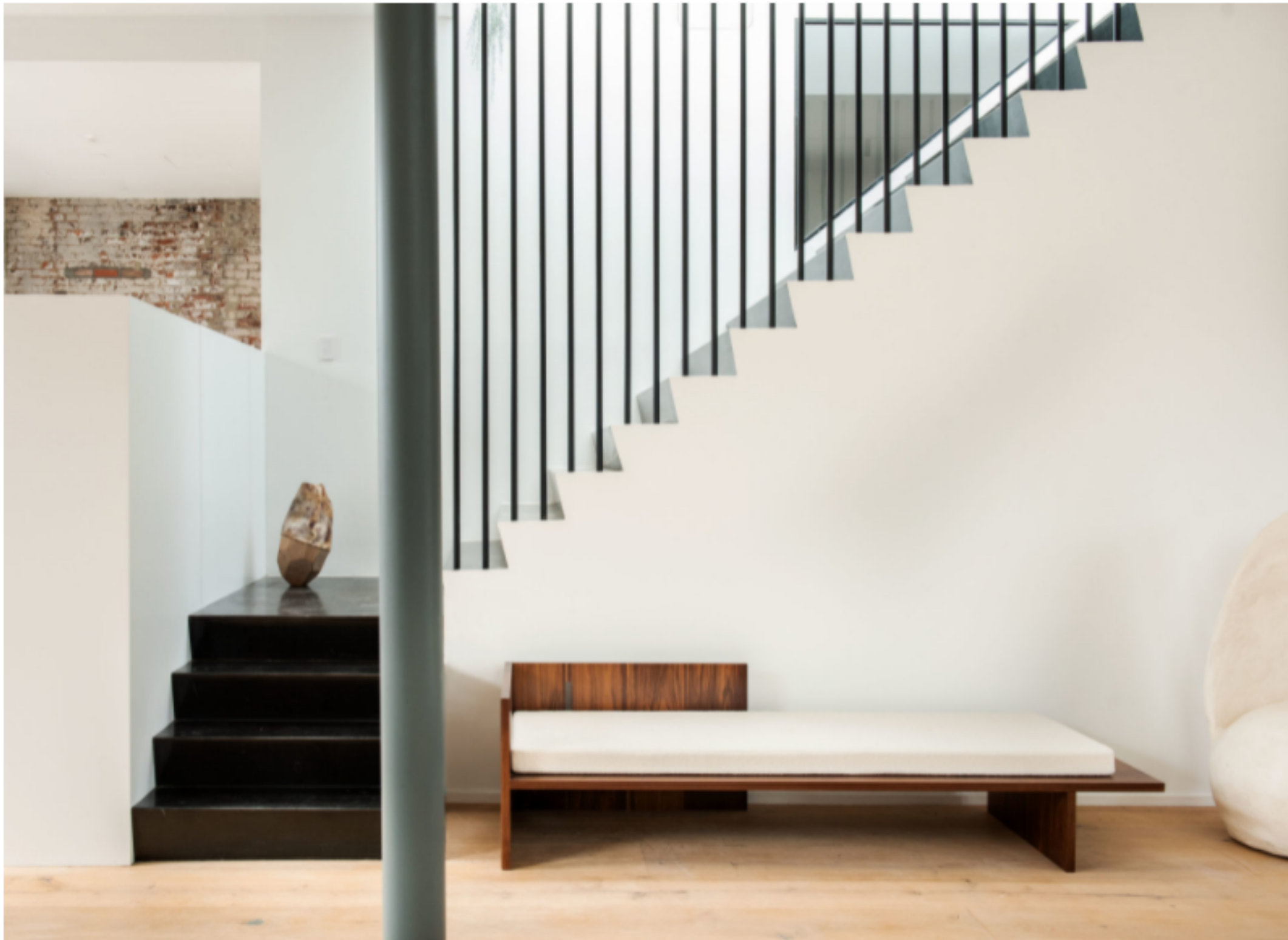
Gregory Beson's Unique GB201 Walnut Daybed offers the perfect lead up to the private roof top. (Jonathan Puente)

Yasmine's After Ago side tables harken back to Postmodernism and the Memphis collective but are inherently geometric and pared-back in form. Beson's wholly rectilinear tables, chairs, and benches make a strong case for the sanctity of monumental proportions and simplicity. Kar Studio's expressive fiberglass forms draw from eastern philosophies. Rustic sheepskin rugs by Carine Boxy juxtapose Jason Mizrahi aerospace-grade composite creations. Though surprisingly succinct, this extensive collection is a true sampling of contemporary collectible design as it stands today.