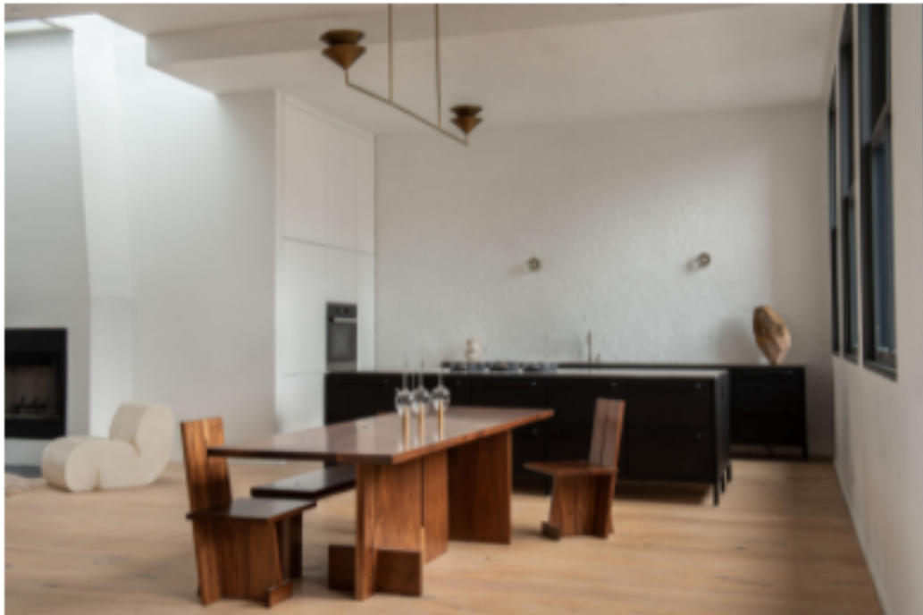
The kitchen and dining area includes more Beson furniture, a Volker Haug chandelier, and a vessel by Sylvia Eustache Rools and Jerome Pereira. (Jonathan Puente)

Set up in the sprawling modernist apartment and its Canal Street adjacent private roof top are 80 works. Presented in staged living rooms, dining rooms, bedrooms, bathrooms, and alcoves, these furnishings, luminaires, and accessories demonstrate Galerie Philia's ability to stage luxury properties. The visual relationships forged represent multiple permeations, sensibilities, and lifestyles. The underlying thread of muted tones, organicism, and sculptural articulations interplay well with hardline geometric planes. Texture abounds throughout the exhaustive selection.