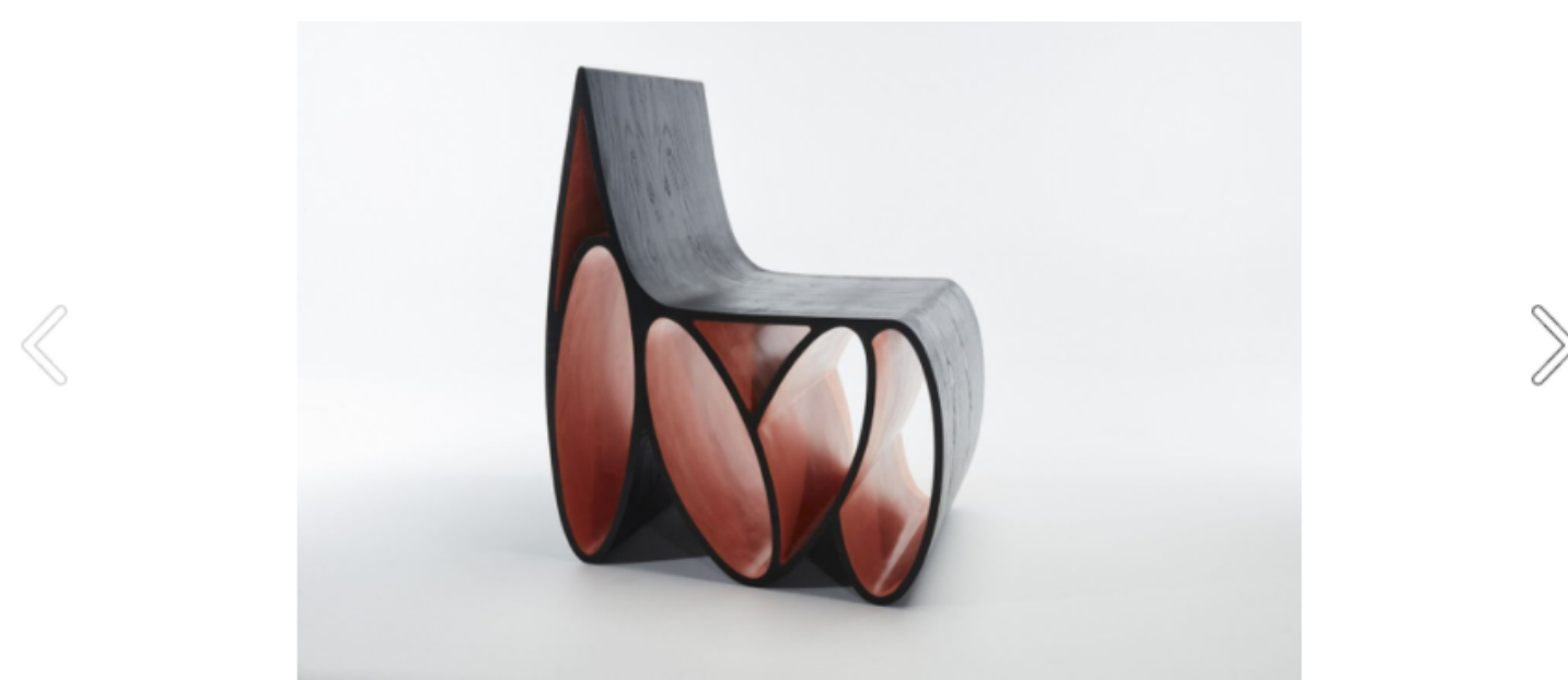
Loop chair by Jason Mizrahi

Transcending and integrating geographical and design barriers, the collection of works, encompassing furniture and product designs , as well as functional sculptures, revel in style, strength, and quality. "This exhibition reflects Galerie Philia's eye for works that emanate from different cultures and transcends formal, stylistic, national, and historical barriers. The collection on show unites a wide range of artistic worlds connected by their interculturalism and sheer artistic quality, regardless of their point of origin. Each work has an intrinsic aesthetic value which together creates a constellation of visible relationships with no centrepiece. Resisting trends and time, this collection offers multiple permutations, adapting to ever-changing interiors, sensibilities, and lifestyles," shares Galerie Philia .