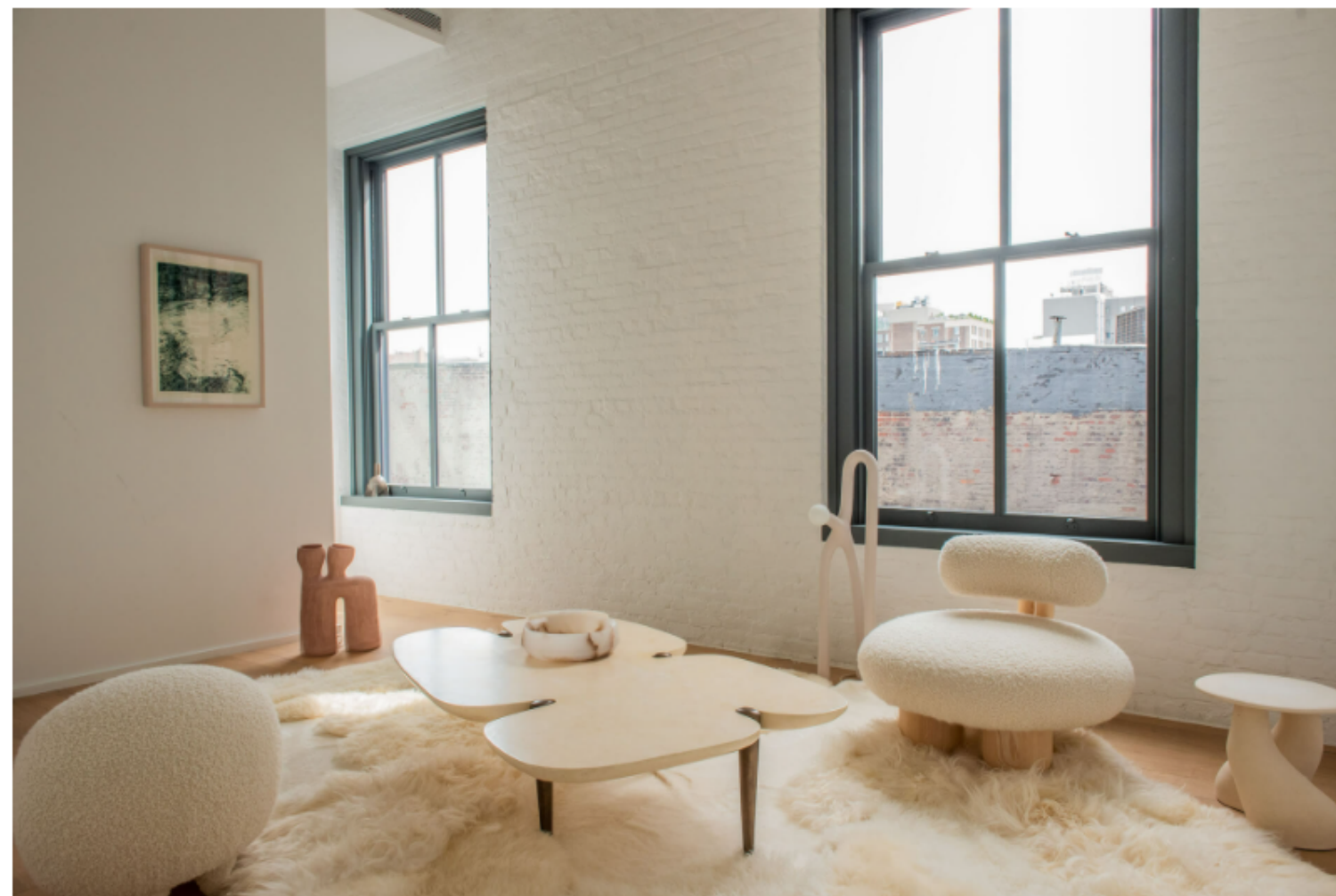
First Times is planned in an apartment, to show various possibilities of Philia Interiors

The gallery was founded in 2005 by two brothers who share a mutual passion for art, literature and philosophy, which led to naming it 'Philia', considered the "highest form of love", "friendship" and "affection" in Greek. The design exhibition is on from October 5 to December 3, 2021, in an apartment in New York, showing various possibilities of Philia Interiors' unique perspective on staging, for luxury real estate listings in the United States, Latin America, and Europe.