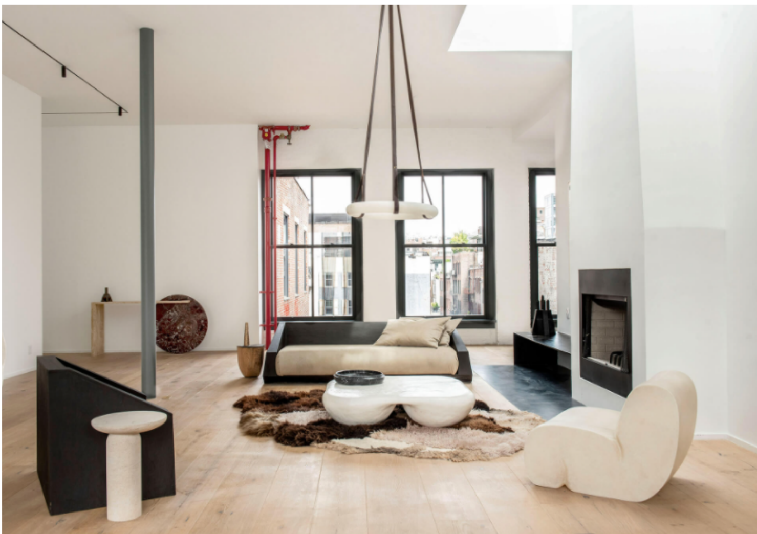
A glimpse of the exhibited works for First Times, an ongoing design exhibition at Galerie Philia in New York

Declaring profound love and a penchant for sculptural art and design, Galerie Philia's latest exhibition in New York , called First Times , is a dazzling exercise in immersive, livable design and art, a step further in cross cultural, creative endeavours. Marking their arrival in the United States , the international design and art space impresses with an elegant plethora of intercultural works by established product designers who have not exhibited with the gallery, and for some of them, never shown in the States, in tandem with introducing for the first time, their new Philia Interiors project.