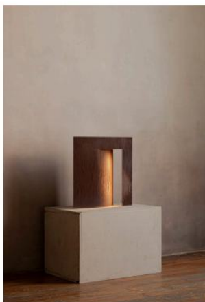
OBJ-03 table lamp

the LED stripe is hidden on the back and contained in a solid steel bar. the weight of this part is essential to give stability to the lamp. thus, all the parts fulfill an indispensable function for the object.