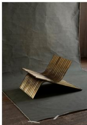
OBJ-02 lounge chair

the OBJ series and the lounge chair made of sliced brass tubes will be on show at the upcoming exhibition transatlántico in mexico city (read more on designboom here ) organized by galerie philia.