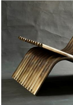
detail of the OBJ-02 lounge chair

the brass is preserved unsealed and with all the defects of its manufacture and handling. also, when bending the tube halves, the metal must be heated and this creates the darker visible parts of the chair. over time the entire chair will age and change its appearance.