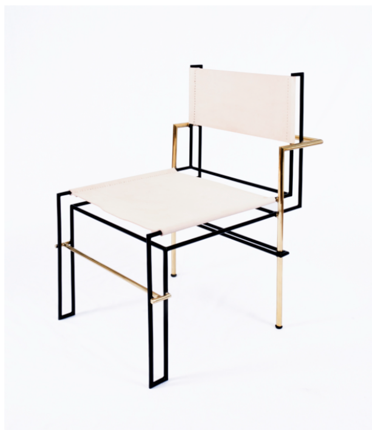
Casbah Chair from Collection 12.16 by Nomade Atelier, 87cm x 74cm x 43 cm, brass, iron, leather