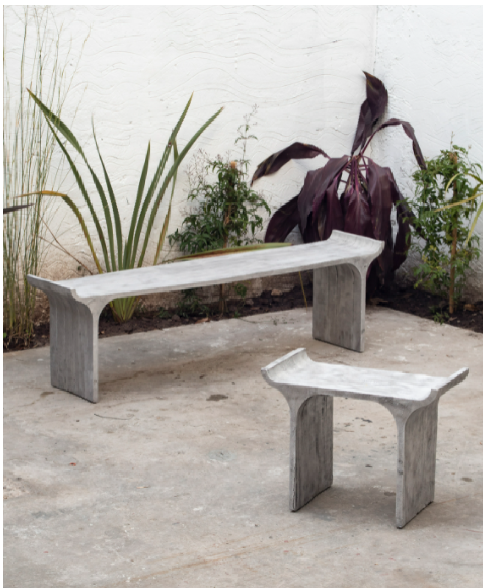
Tori Benches by Ries Estudio, 2019