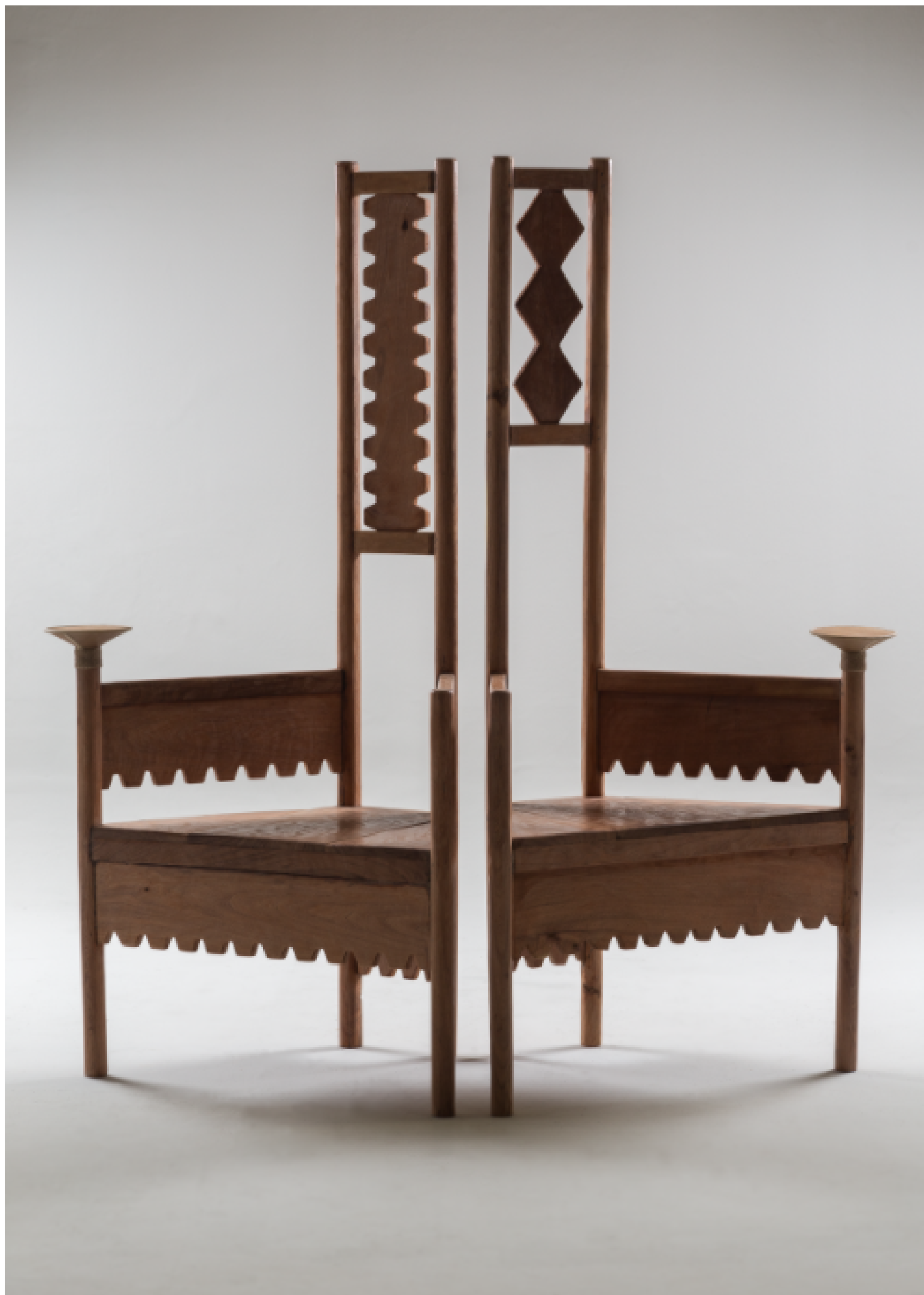
Toribio and Alcira Chairs by Cristián Mohaded, Toribio: 142 x 66 x 45 cm, Alcira: 142 x 66 x 45 cm, Carob wood