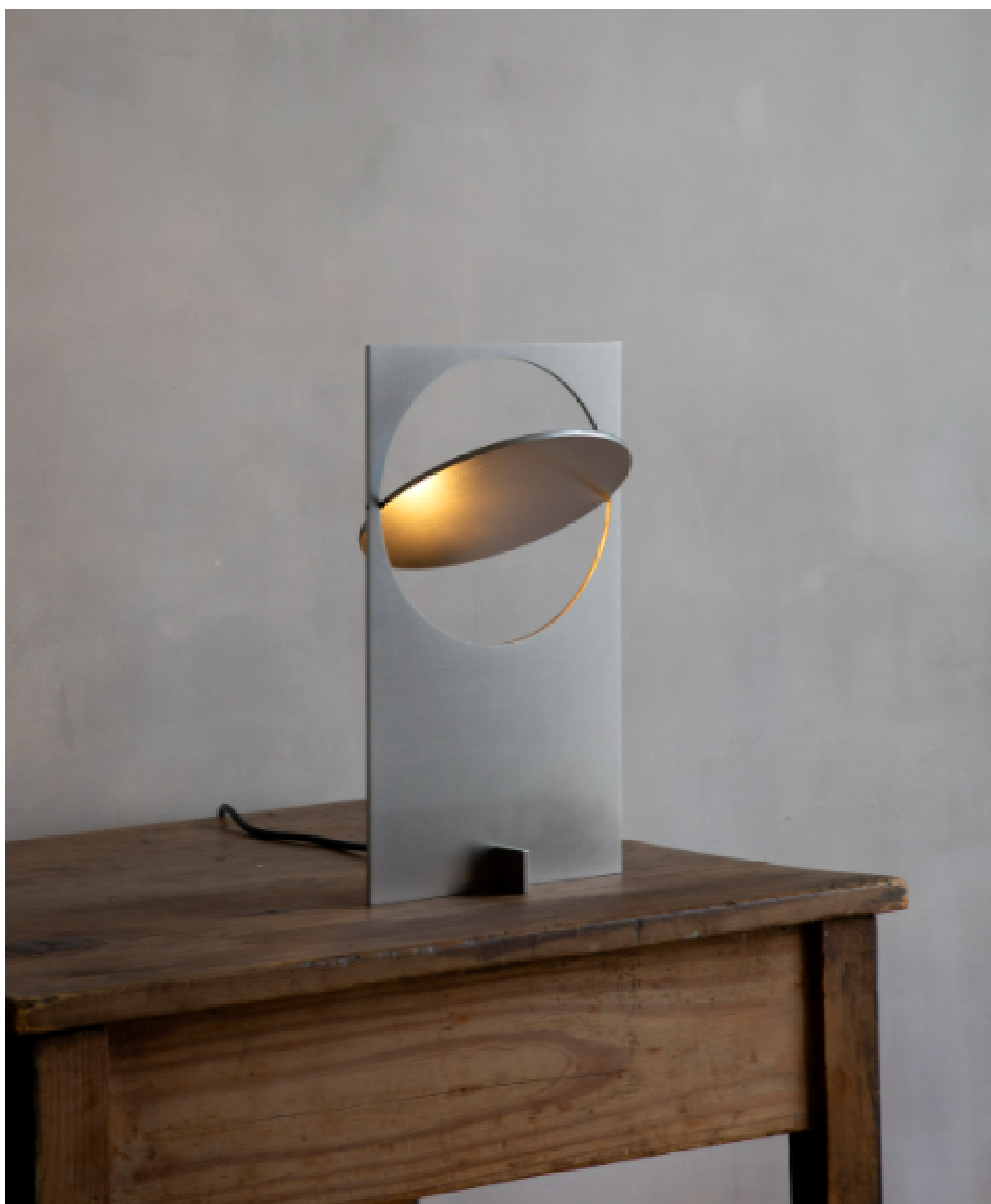
BJ-01 Table Lamp by Manu Baño, 38 x 22 x 7 cm, steel