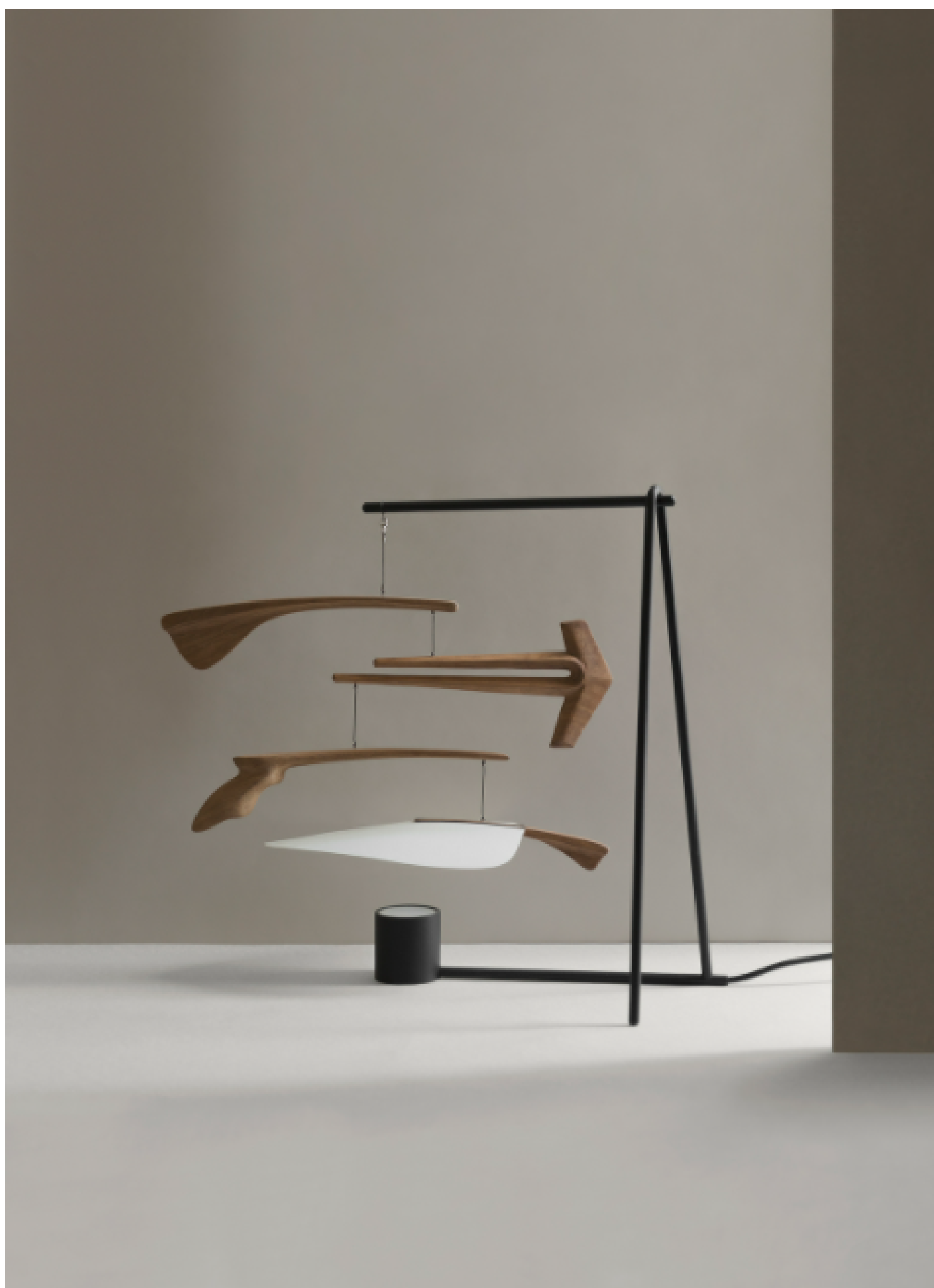
Óseo Light by Federico Stefanovich, 2019, 45 x 47 x H 45 cm, solid walnut wood, steel, parchment paper