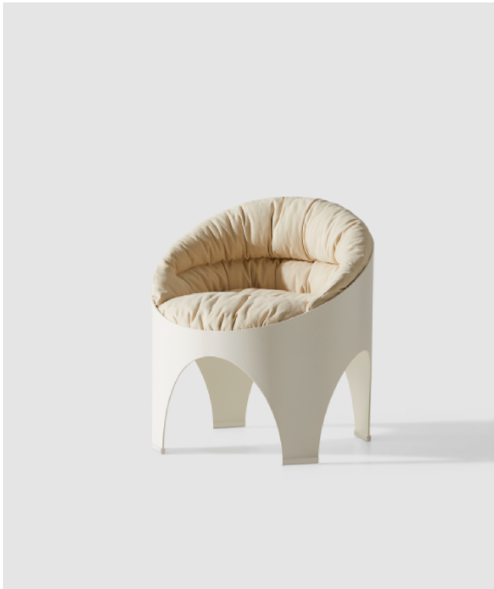
MILOS Chair by Alexis Christodoulou, 65 x 70 x 43 cm, iron structure and MDF board, seat foam CMHR, backrest 50% goose feather and 50% polyester fibre