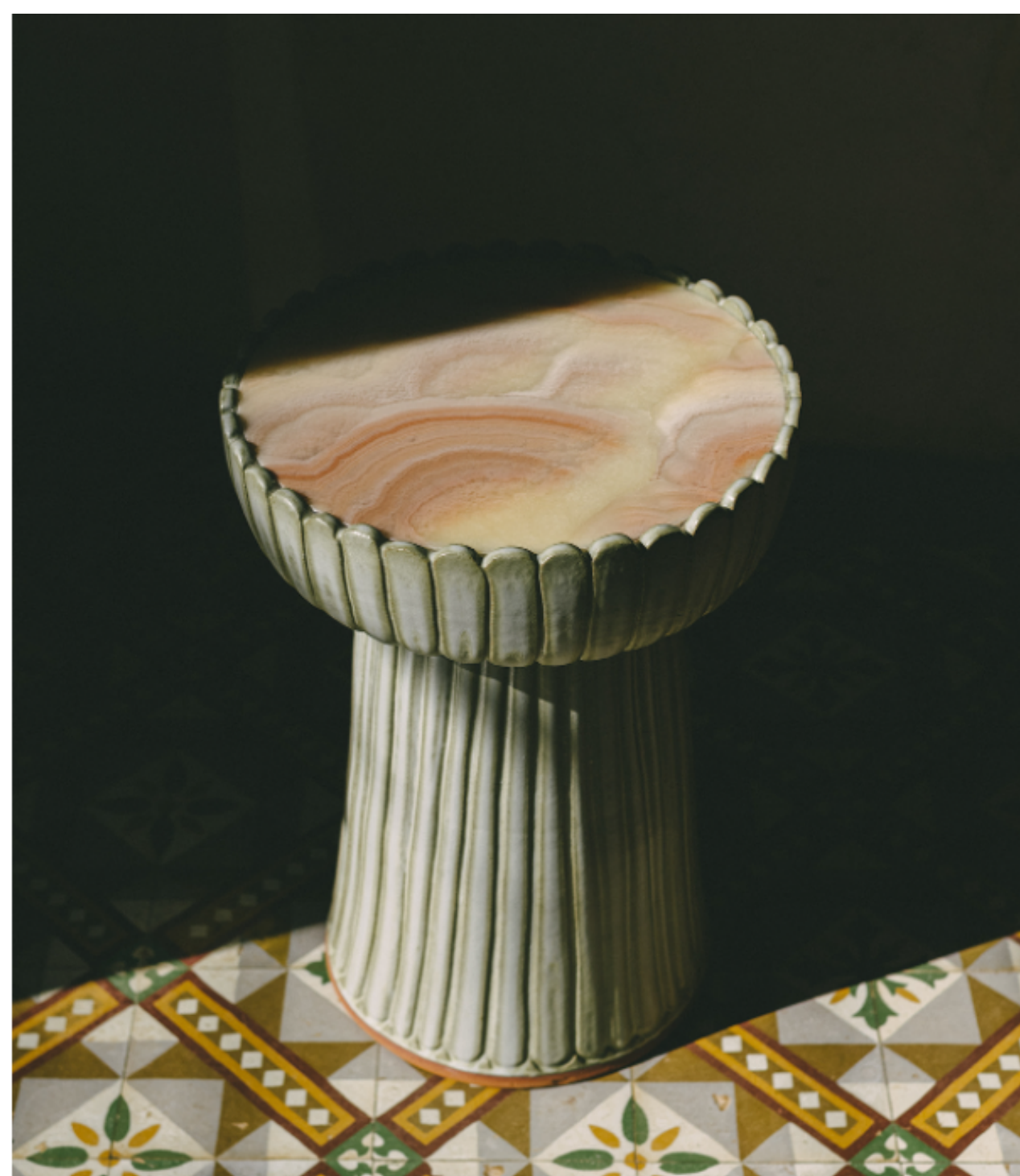
Clam Side Table by Casa Alfarera