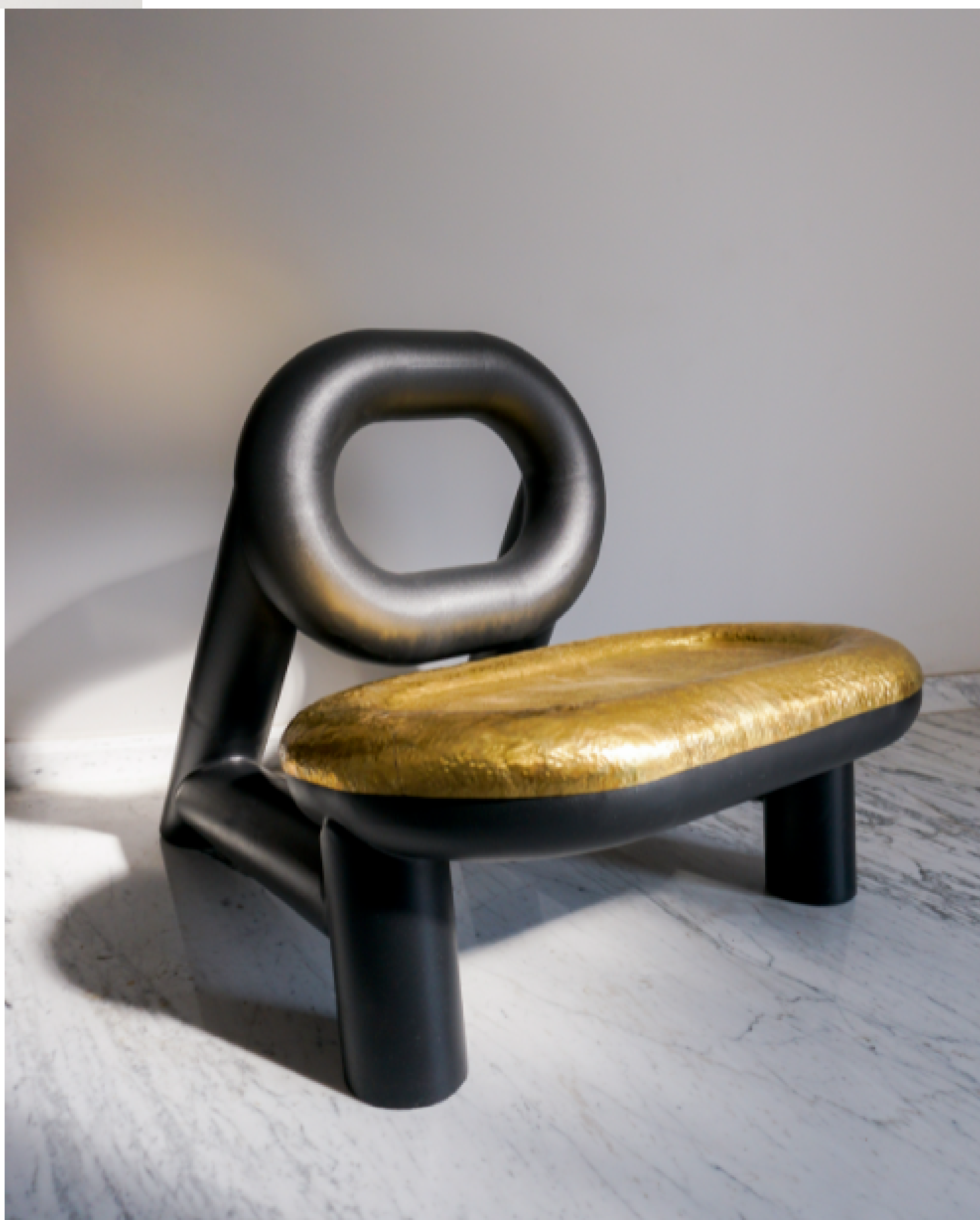
Yo Jaguar Chair by Rodrigo Lobato Yáñez for Platalea Studio, 70 x 72.4 x 85.8 cm, steel round tube, steel elbow pipe, electrostatic paint, brass sheet

Visit Transatlántico in person: February 8-12, 2022 Avenida Ejército Nacional 676, INT 501, Polanco III Sección 11540 Miguel Hidalgo, CDMX Mexico City, Mexico