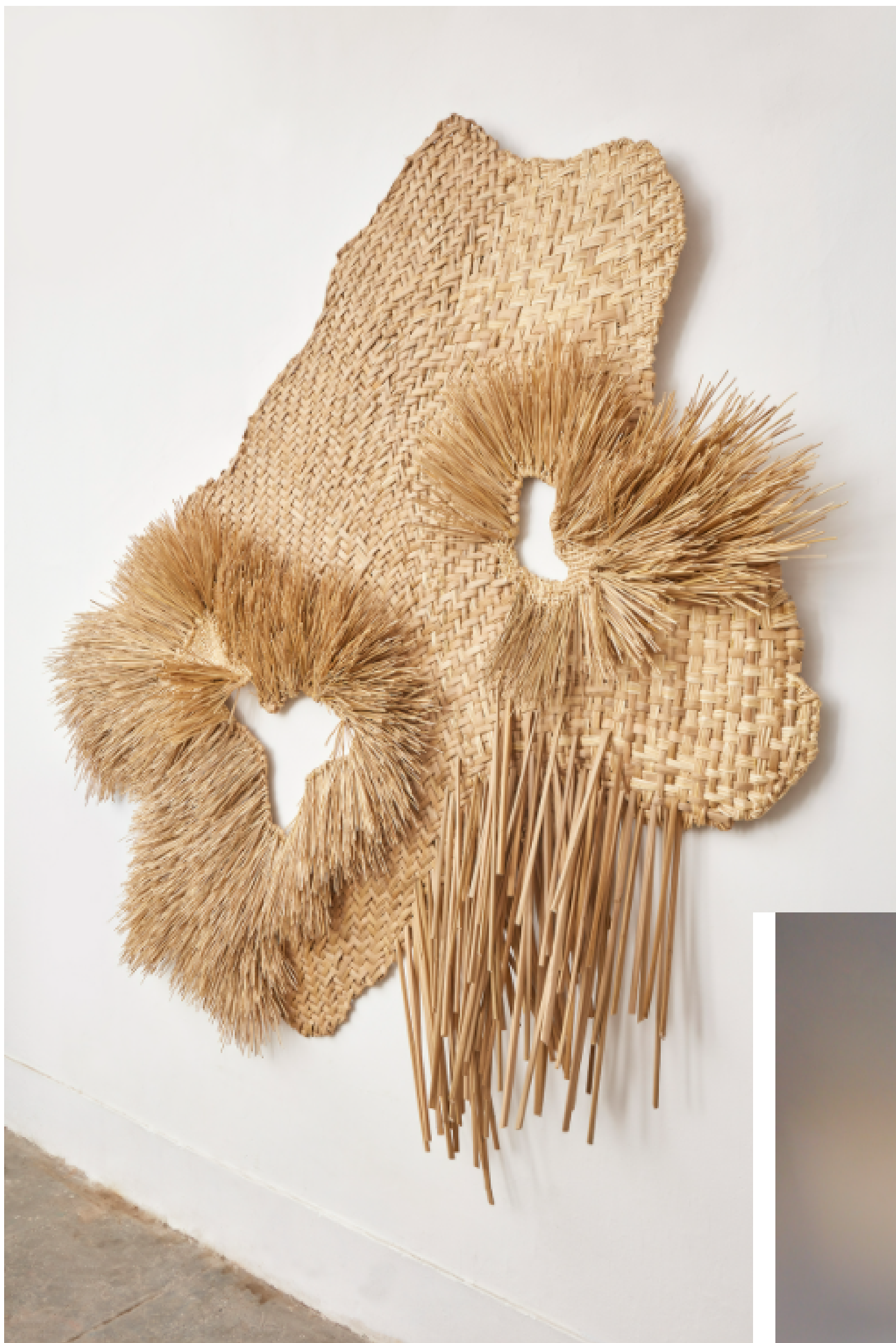
Wetland 2 by Studio Raffreyre, weaving in reed and bulrush from Huacho wetlands