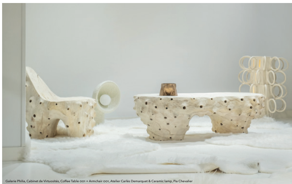
Galerie Philia, Cabinet de Virtuosités, Coffee Table 001 + Armchair 001, Atelier Carlès Demarquet & Ceramic lamp, Pia Chevalier