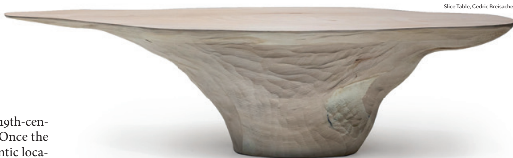
Slice Table, Cedric Breisacher

The Cabinet de Virtuosités exhibition runs until 29 April and is the first of many lasting collaborations between Galerie Philia and the Parisian showroom of Atelier Alain Ellouz. (Text: Nathalie Van Laer)