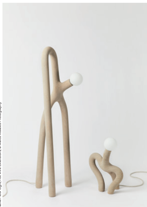
Native Floor Light, Hot Wire Extensions.

moved to one of the remaining late 19th-century brick warehouses in Bruges. Once the restoration is complete, this authentic location will house the studio and a selected collection of refined vintage design. His Data table in an ebonised version is now part of the Cabinet de Virtuosités . The design consists of a free-form top in solid Oregon with smooth rounded edges and three hand-turned trapezoidal legs.