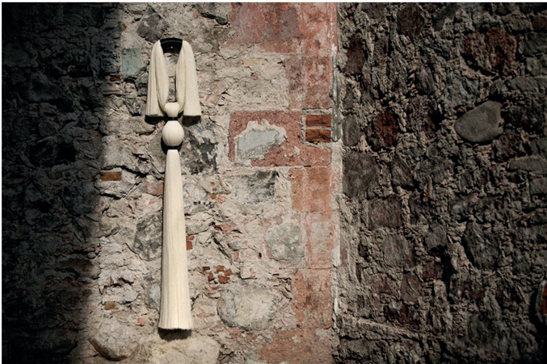
bruja sencilla wall hanging by caralarga 122 x 243 cm 100% raw cotton, sansevieria, wood, and steel

geneva, new york and singapore-based galerie philia presents transatlántico , an immersive exhibition that uses design to bridge latin american and european discourses and influences within the creative spheres. taking place in mexico city and coinciding with zona maco, the show highlights the gallery's core philosophy of celebrating artistry as a medium to transcend societal, cultural and geographical boundaries.