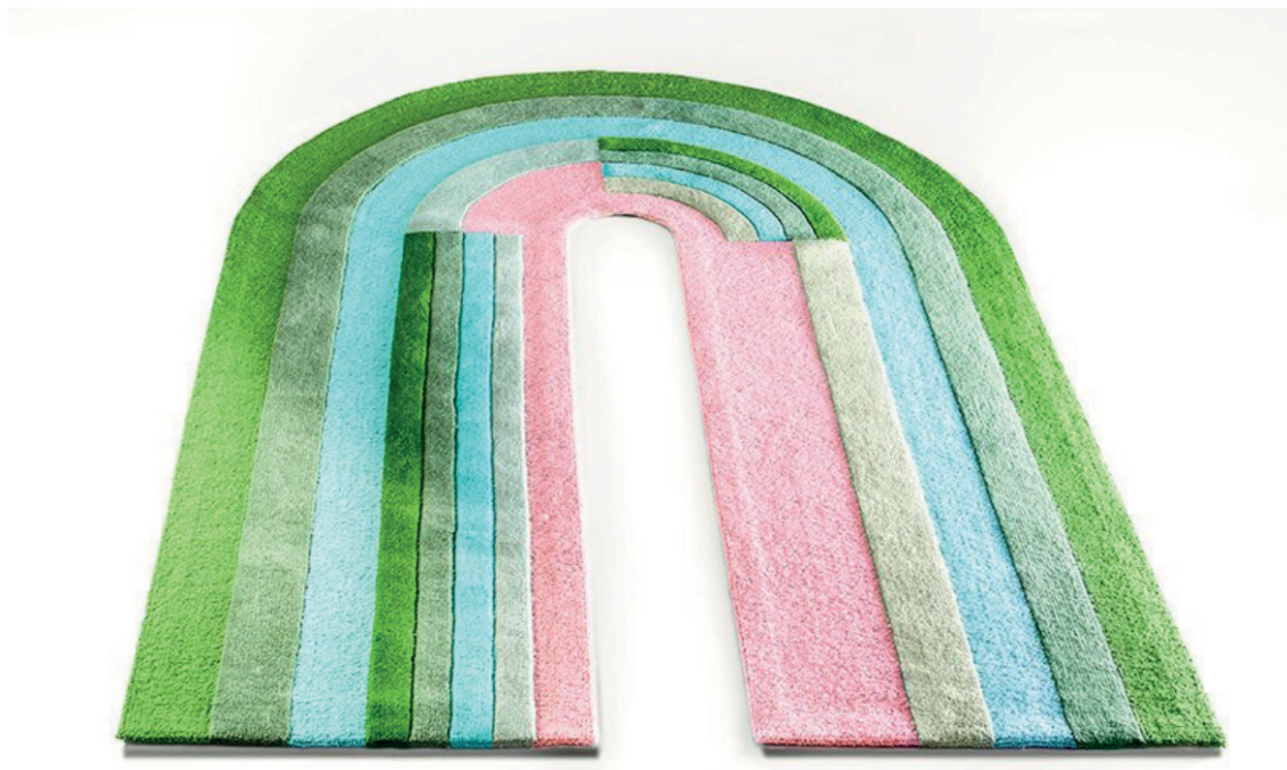
happiness rug by lilia cruz corona garduño for platalea studio 14 x 19.5 x 25 cm 100% new zealand wool on cotton mesh

the exhibition design has been created in collaboration with house of kirschner, known for their ephemeral installations. by bringing the finest food, sound, sight, and olfactory experience, the show aims to transform the massive space into a memorable moment.