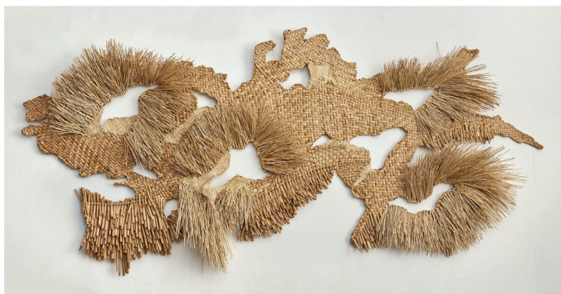
wetland 3 by studio raffreyre weaving in reed and bulrush reed and bulrush from huacho wetlands courtesy of galerie philia 2022