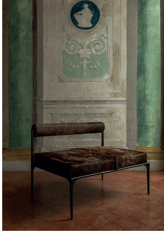
alchemy bench by rick owens 100 x 74 x 75cm bronze, camel skin