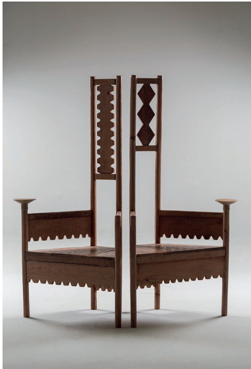
toribio and alcira chairs by cristián mohaded toribio: 142 x 66 x 45 cm alcira: 142 x 66 x 45 cm carob wood