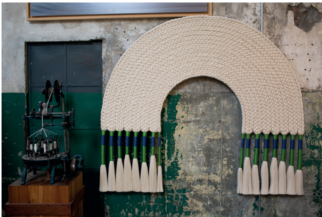
arcoiris beta wall hanging by caralarga 176 x 152 cm handmade, 100% raw cotton yarn, sansevieria fiber ties and/or cotton yarn. MDF piece has blacksmith connectors to install on the wall

featuring the works of 35 designers from latin america and europe, transatlántico showcases pieces that explore native materials, sustainability and ecology. a dialogue is created when these pieces are juxtaposed with funky ones, resulting in a network of harmoniously interconnected roots.