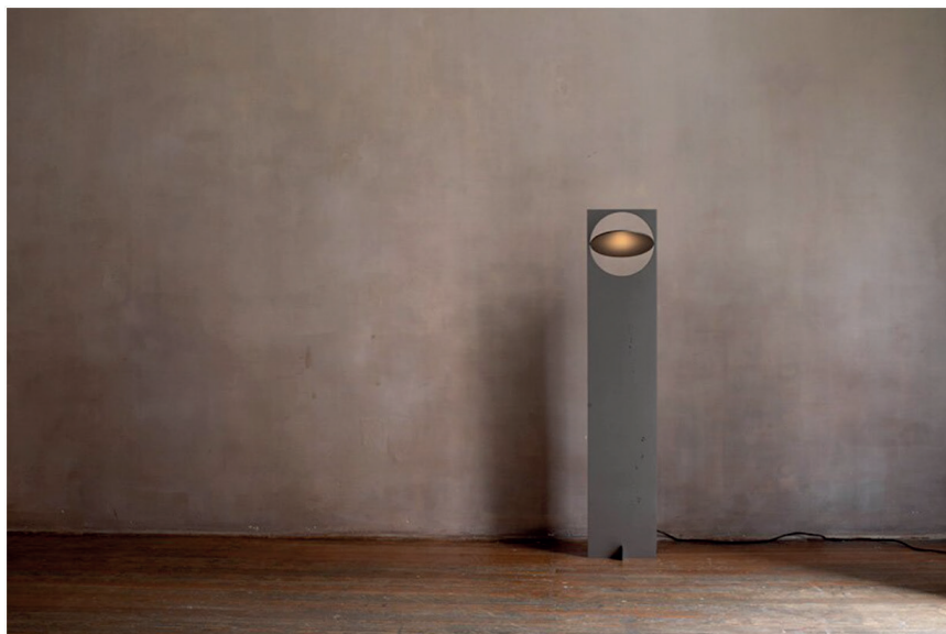
obj-01 floor lamp by manu baño 122 x 24 x 12 cm steel

galerie philia's transatlántico exhibition unfolds across 700sqm of gallery space and a specially designed rooftop. visitors will encounter a multi sensory journey of vibrant sight and sound displays, with andres monnier's signature rugged boulder fire pits. rio de janeiro-based studio roca has engineered functional pieces that add to the experience by diffusing scents that evoke the mexican ecosystem.