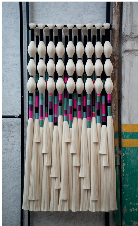
son chiapaneco wall hanging by caralarga 122 x 243 cm handmade, 100% raw cotton yarn, dyed cotton yarn, papier-mâché spheres, hangs from black ironwork bar + supports.