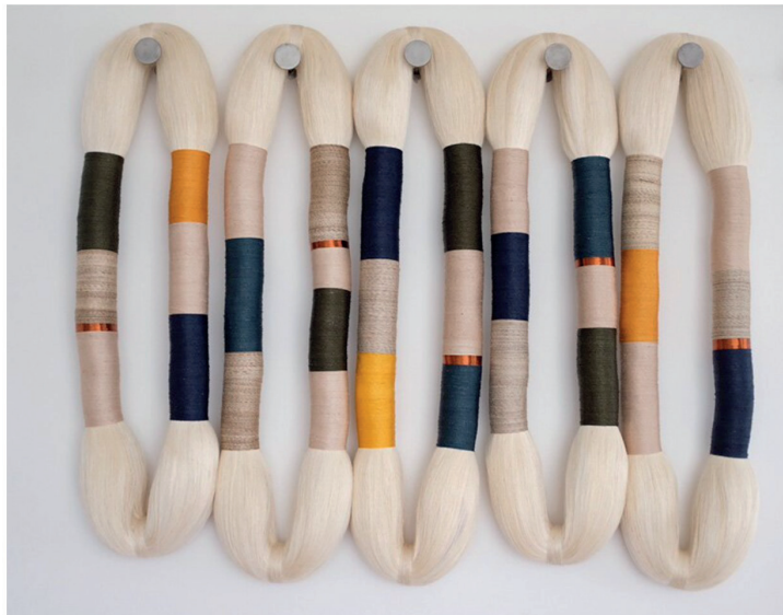
wall hanging by alejandra aristizábal fique and copper 2021