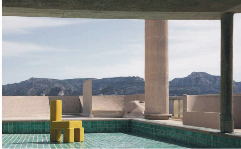
'Licitra' chair by Pietro Franceschini.