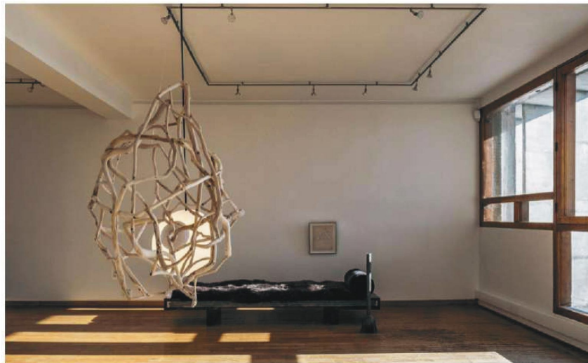
'Héritages', exhibition view.