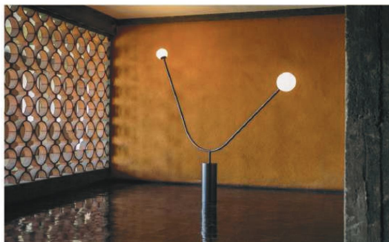
'Héritages', exhibition view. Photo: Maison Mouton Noir. Courtesy of Galerie Philia. Courtesy of Le Corbusier Foundation, © FLC A.D.A.G.P, Paris, 2022