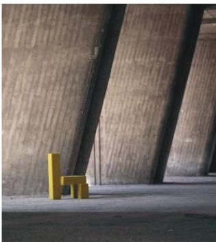
'Licitra' chair by Pietro Franceschini.