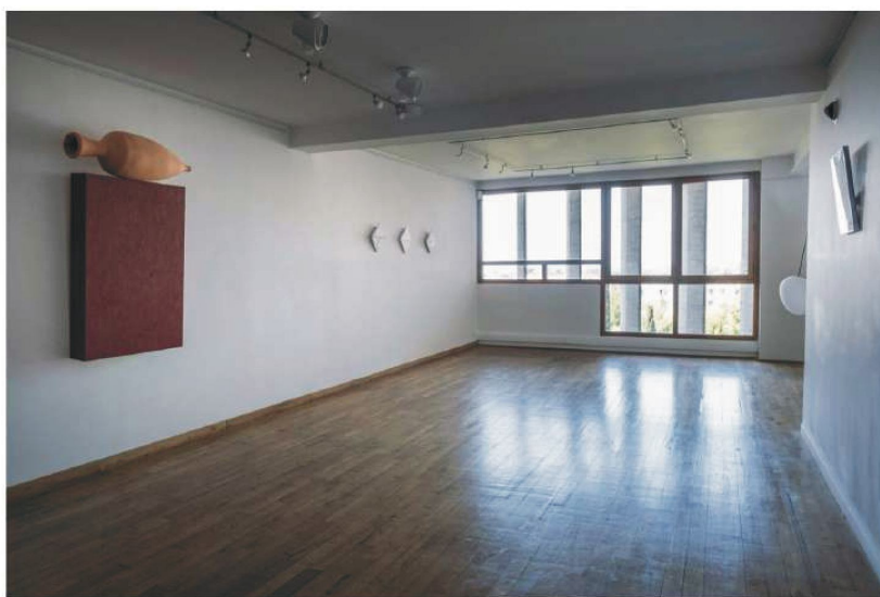
The exhibition intends to echo its location.

"All of the works in one way or another are an answer to Le Corbusier's theoretical and aesthetic heritage, either as a mark of resistance or a touching homage to his legacy," concluded Attali.