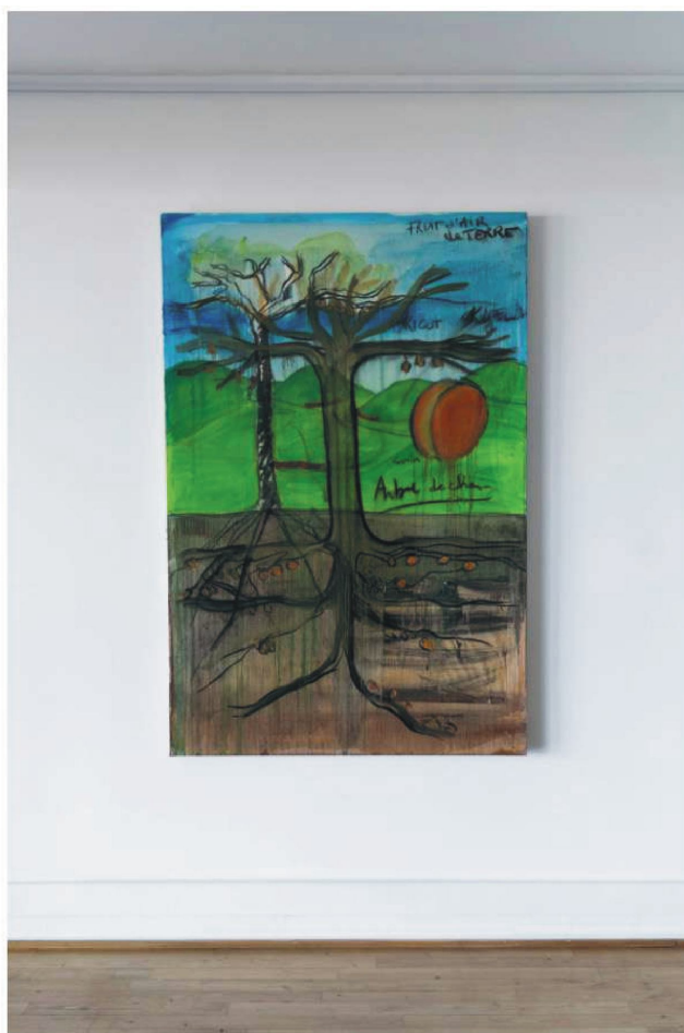
Fabrice Hyber created an oil painting for the "dissonances" space.

Spread across two rooms in an apartment, the exhibited designers respond to the theme of "resonances" with work that is heavily influenced by Le Corbusier's theories, while the artists are guided by the theme of "dissonances" and present work that opposes the theories.