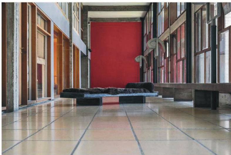
A daybed by Arno Declercq features in the "resonances" room.

Héritages presents work by eight international designers and seven visual artists that reference the modernist theories pioneered by Le Corbusier, whose designs are known for their functionality and minimalism.