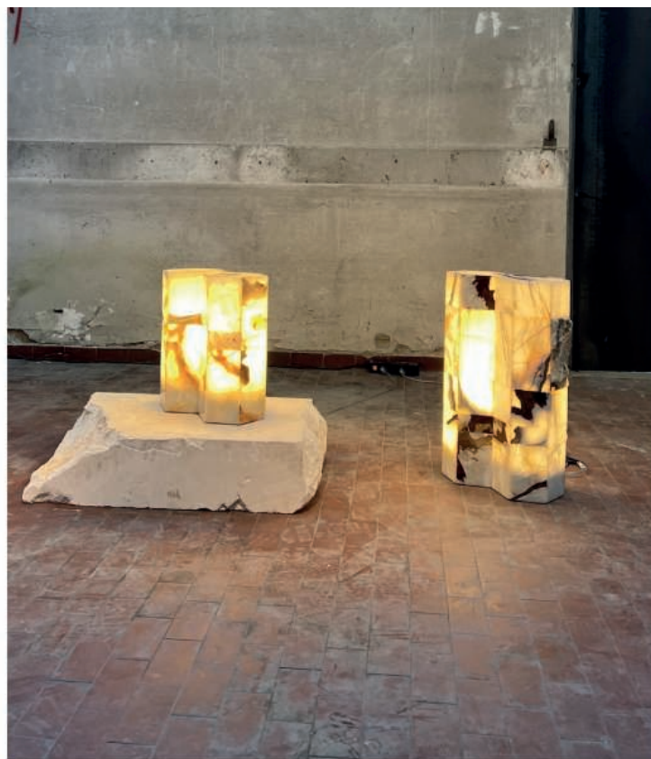
Frontera Floor lamps by Christian Mohaded