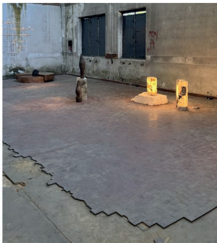
Hermanos sculptures and Frontera Floor lamps by Christian Mohaded