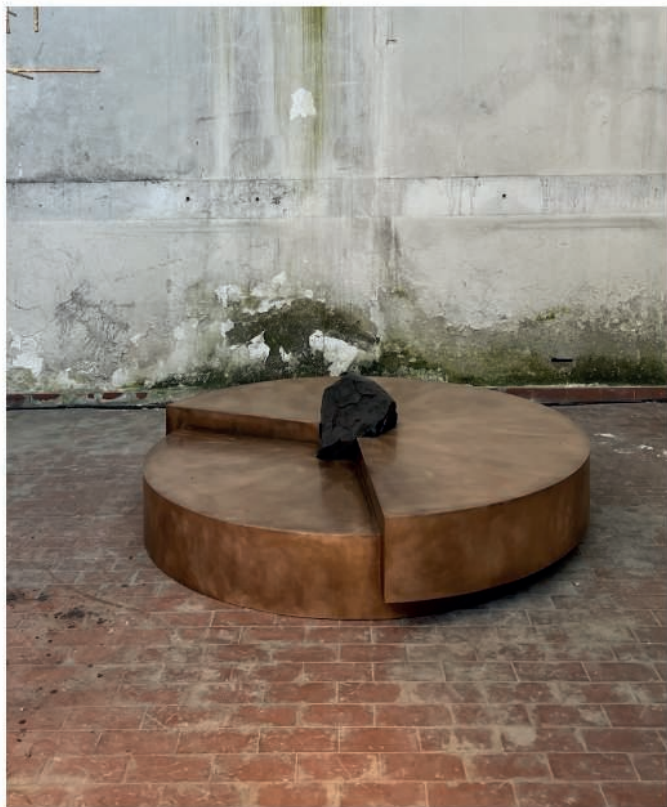
Timetable by Pierre de Valck