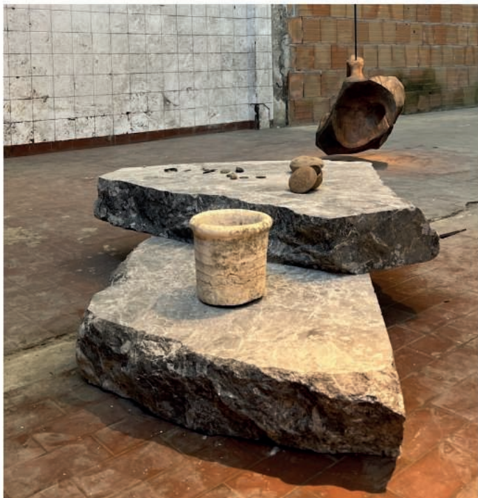
On the stones Pre Colombbian art from the first Millenium third Millenium BC Egyptian vase