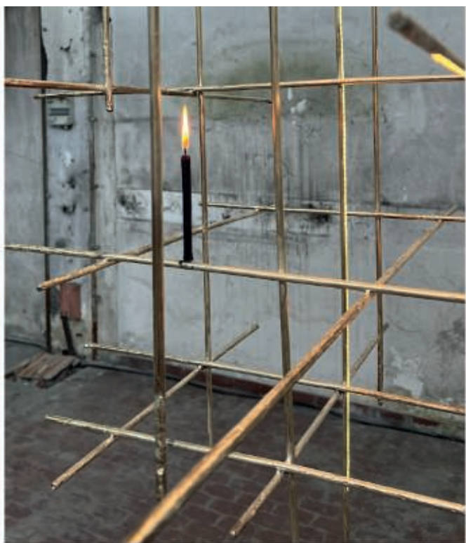
Kairo by Morghen