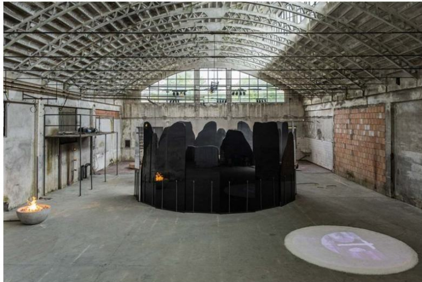
Temenos by Studioepepe

In the evocative setting of an industrial archaeology site of over 220 sqm , inside the former Necchi factory at Baranzate , Galerie Philia explores the sacred through the sculptural works of Arianna Lelli Mami and Chiara Di Pinto . Also known as Studioepepe