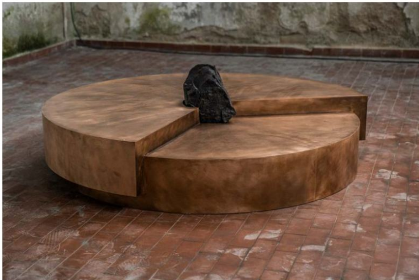
Temenos by Studioepe

Works that also reference the “mentors” of the artistic duo, including Constantin Brancusi, Isamu Noguchi, Le Corbusier. The result is a limited-edition collection exclusively created for Galerie Philia: monolithic seats, a console, a lamp and a mirror, featuring a complete re-reading of their functions, eliminated or transformed in the symbolism attributed by man.