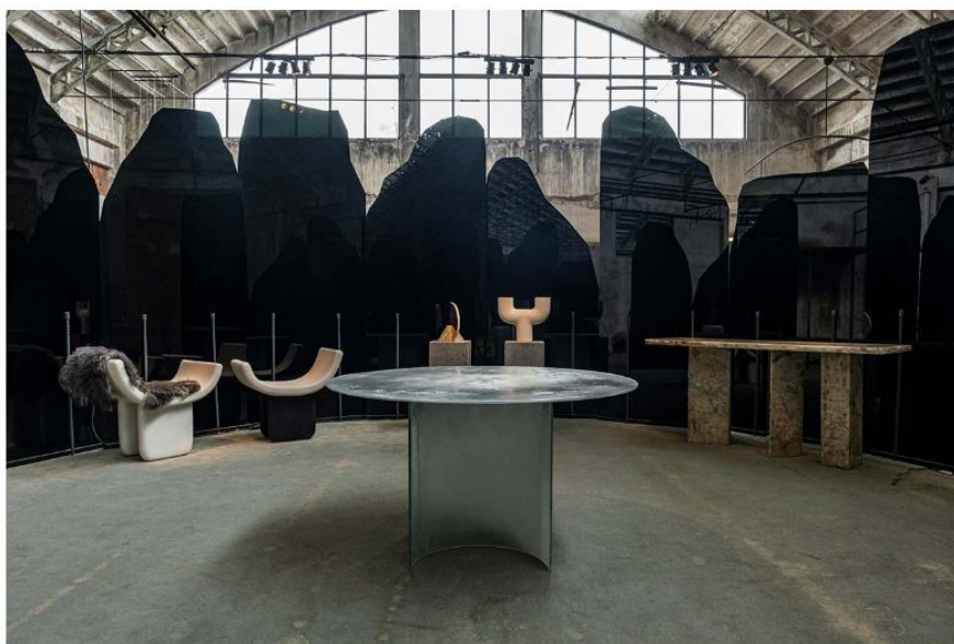
Temenos by Studioepepe

In the evocative setting of an industrial archaeology site of over 220 sqm , inside the former Necchi factory at Baranzate , Galerie Philia explores the sacred through the sculptural works of Arianna Lelli Mami and Chiara Di Pinto . Also known as Studioepepe