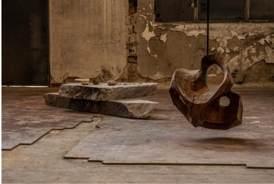
Temenos by Studioepe

A cylindrical structure placed at the center of the space interpreted the form of a temple and revealed the eclectic pieces by Studioepe, with their non-conformist design approach and painstaking research on formal archetypes. “ Temenos – says Ygaël Attali , co-founder of Galerie Philia – represents the start of our collaboration with Studioepe. Their organic-sculptural design, entirely made by hand, brings out the beauty of imperfection in a complete work. Studioepe has produced a powerful set of pieces that stand out for their thematic and aesthetic consistency.”