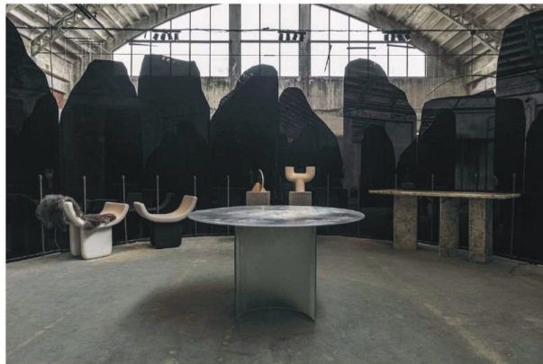
"Temenos" by Galerie Philia