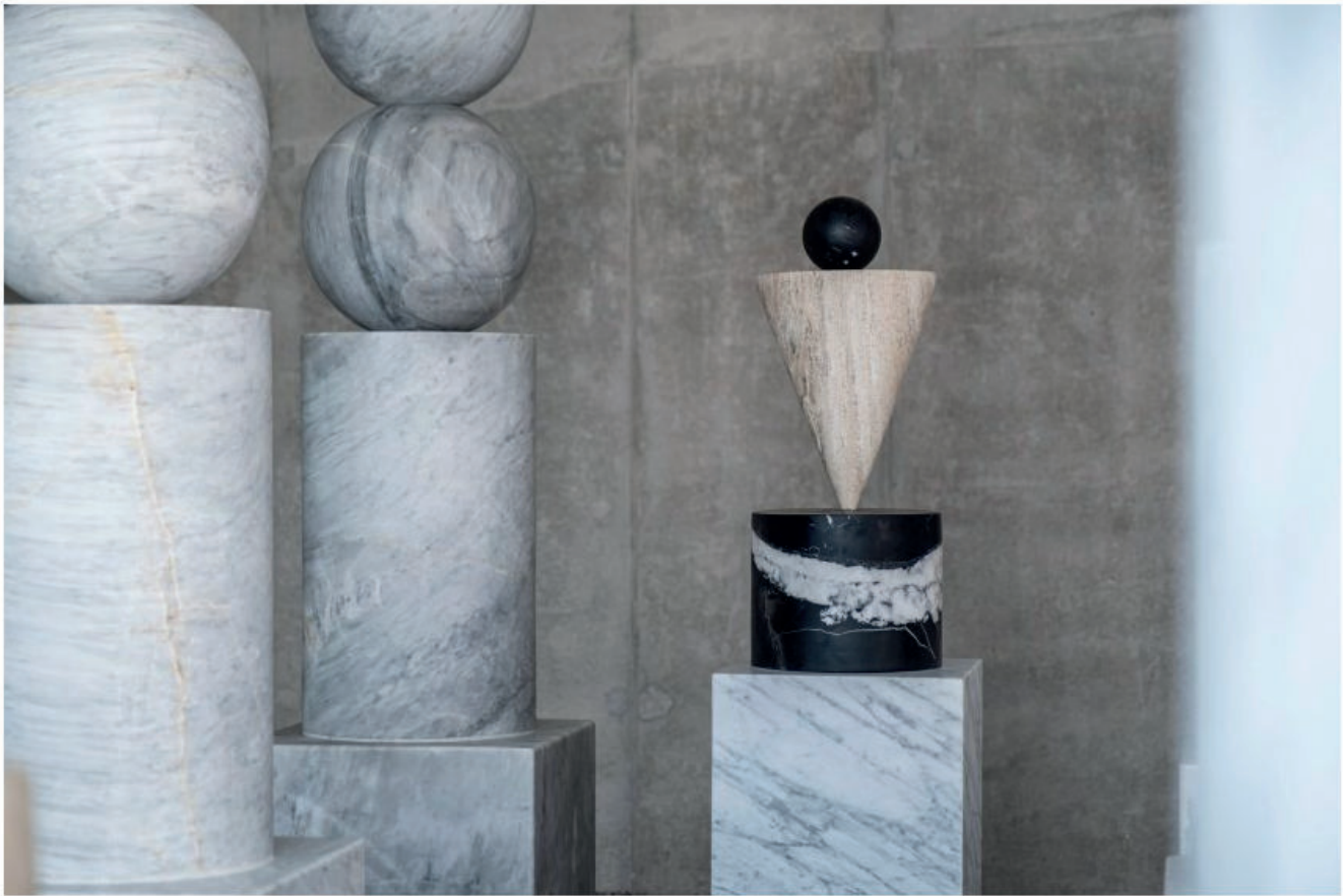
Doors of Perception features geometric stone forms

It includes two primary installations accented by a number of smaller works by each designer.