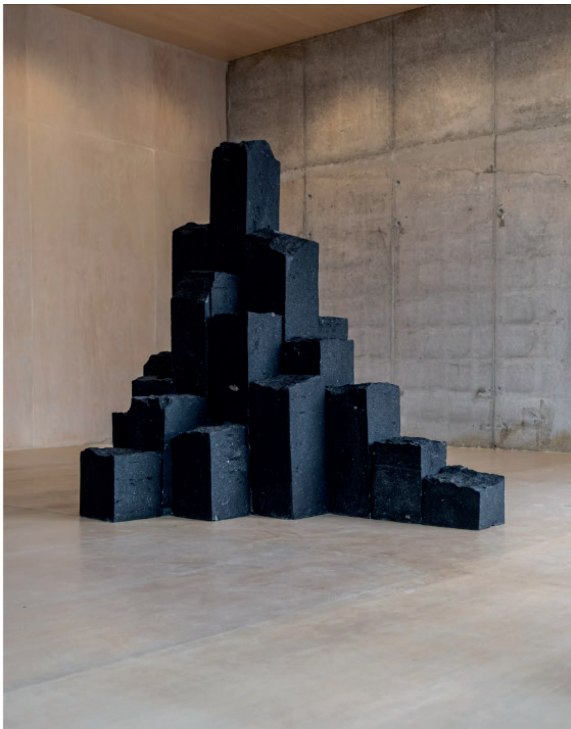
Andrés Monnier's primary installation is called Pyrus

Zeta's installation, called Doors of Perception, is a monumental set of receding columns and arches set on top of a smooth checkered walkway. The whole installation is set upon a gravel surface brought into the exhibition space.