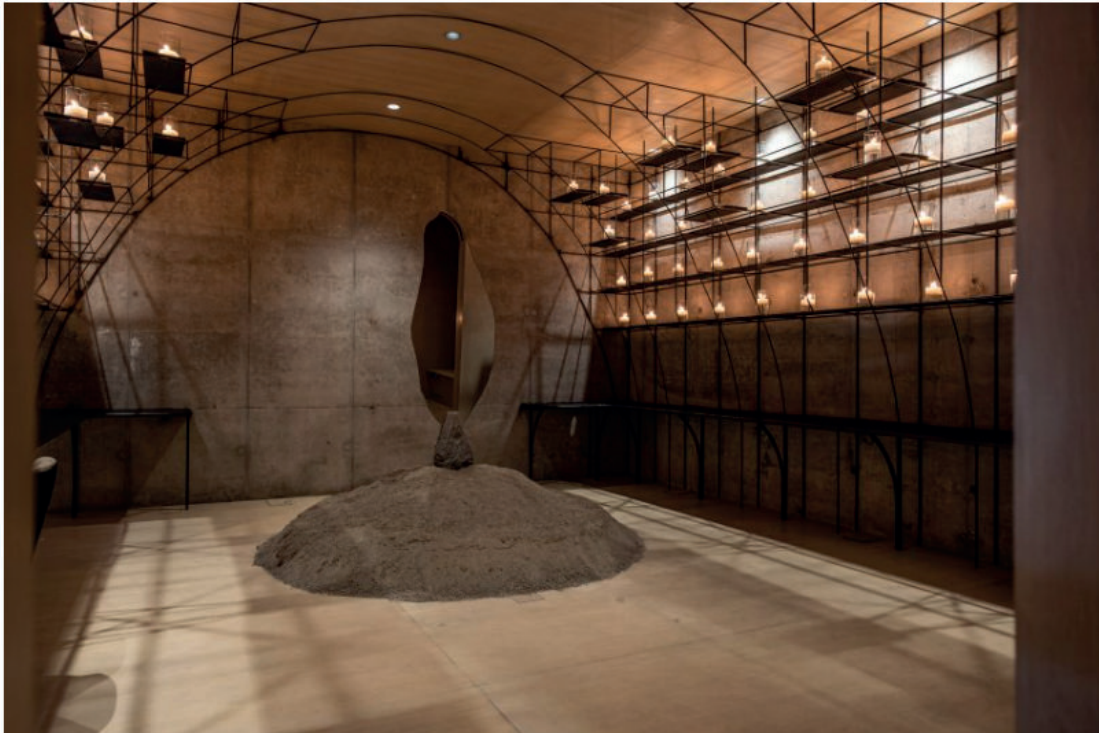
Monnier's mirror was placed inside a metal arch

"Pilar's sublime installation is composed with smooth textures oriented to human perfection: divinity," said the gallery.